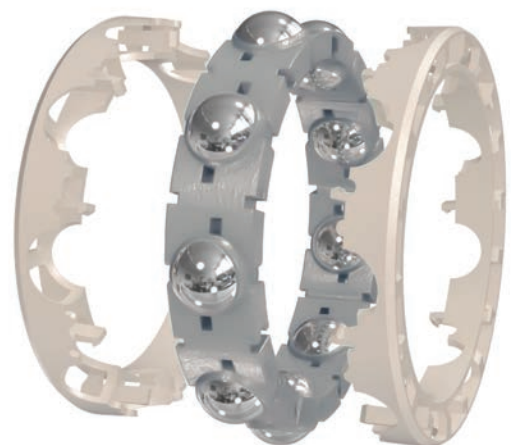
*Grey represents grease in cage

The modified bearing solution stopped grease wash out and provided an easier installation. The pumpkin processor saw downtime due to bearing failure eliminated, saving $35,000 in lost production.