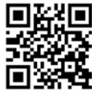
Local Manufacturing Video